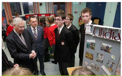
Ulidia Integrated College explain horticultural display.