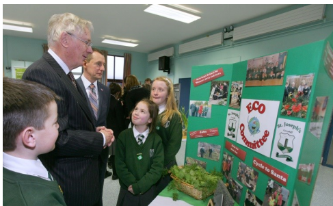
HRH chats to pupils from St Joseph's PS, Carryduff.

His Royal Highness the Duke of Gloucester also had the opportunity to talk to green fingered pupils from visiting Eco-Schools: Ulidia Integrated College, Carrickfergus; Ballycraig Primary School, Antrim; and St Joseph's Primary School, Carryduff, about what they have been growing at school and how they are taking action to protect the environment. His Royal Highness was presented with a locally crafted wooden bowl made from native ash, and planted an apple tree in the school grounds with the pupils. For more on this story visit our website .