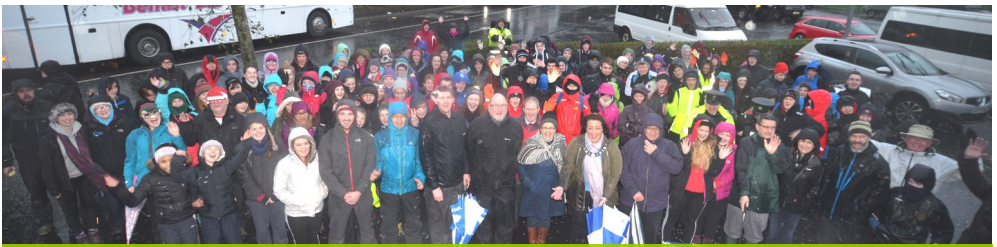
149 volunteers took part in Belfast Royal Academy's annual clean-up in the Mournes.

Also appreciated was assistance given by Newry, Mourne and Down District Council, the Mourne Heritage Trust, the National Trust, the Forest Service and Mark's Skip Hire (Kilkeel).