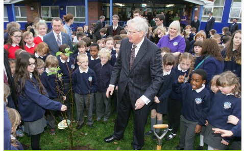
HRH plants an apple tree with a few keen helpers!