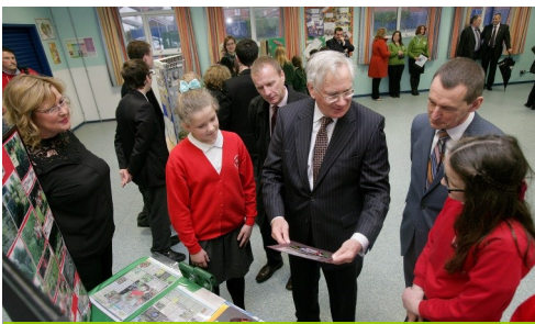
Ballycraig Primary School, Antrim, talk school grounds.