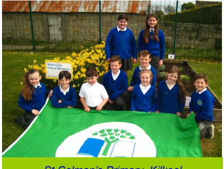
St Colman's Primary, Kilkeel