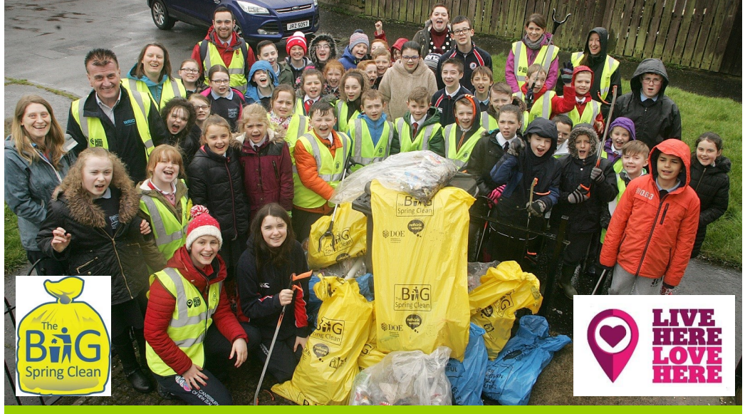
Pupils from Fairview Primary, Ballyclare Primary, Tir-na-Nog Primary and Ballyclare High clean-up.

Northern Ireland, are determined to combat litter and waste. Keep Northern Ireland Beautiful are delighted to be delivering the Litter Less campaign for the fifth year through the Eco-Schools Programme in partnership with the Foundation for Environmental Education. The global campaign is running in 31 countries around the world, raising awareness of litter problems and encouraging positive behaviour changes