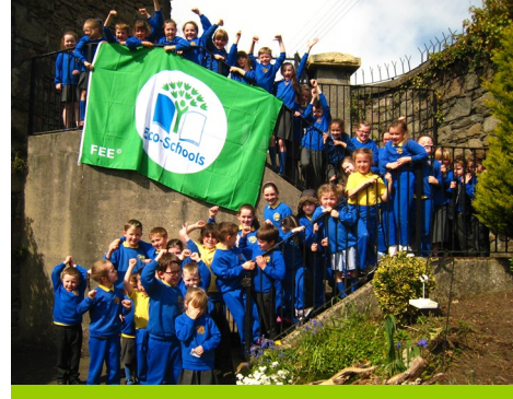
Bunscoil an Luir, Newry